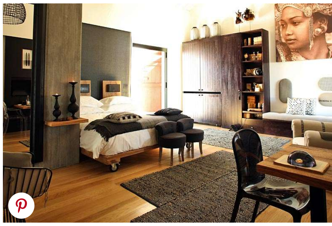
Superior double room Terra

The delightful <u>double</u> and <u>superior double</u> rooms are great for couples or if you're travelling solo. <u>Family rooms</u>, meanwhile, are also a great size for couples settling in for more than a night or two. All of the rooms are so lovingly, creatively put together with distinct colours and themes differentiating them.