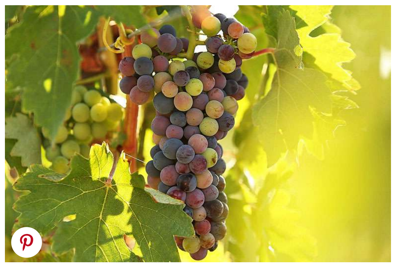
Discover how Torre de Palma produces its wine - photo courtesy of Torre de Palma Wine Hotel

You will only truly get to know Torre de Palma by getting to know its wine, and there's no better place to do so than at the hotel's winery. Pick from a variety of experiences, be it a simple introduction and short tasting, to a more detailed tasting with local delicacies, or a comprehensive look at the way the wine is produced.