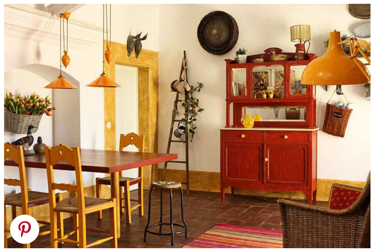
Family room Lago - photo courtesy of Torre de Palma Wine Hotel

The <u>master suite</u>, as you might expect, offers an opulent space in which to relax and unwind for up to five people. Settle into your living and dining areas before seeking out the separate bedroom, all expertly decorated with wood and stone featuring throughout.