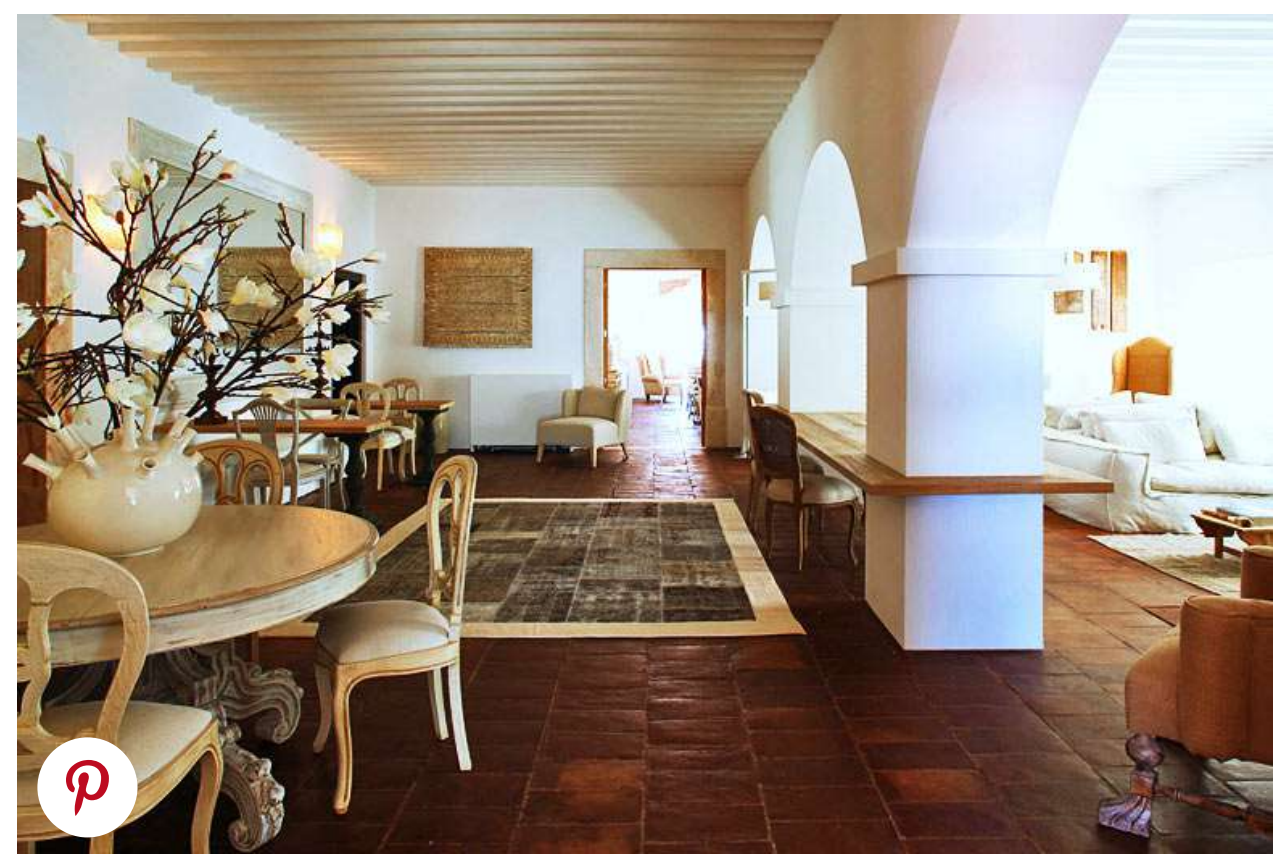
The soft interiors of the lounge - photo courtesy of Torre de Palma Wine Hotel

The house, which dates back to 1338, had fallen into a serious state of disrepair when it was bought by a British couple in the early noughties. In 2014, they opened their exquisitely designed, decorated, and finished Torre de Palma Wine Hotel to the public, and today it welcomes visitors from around the globe.