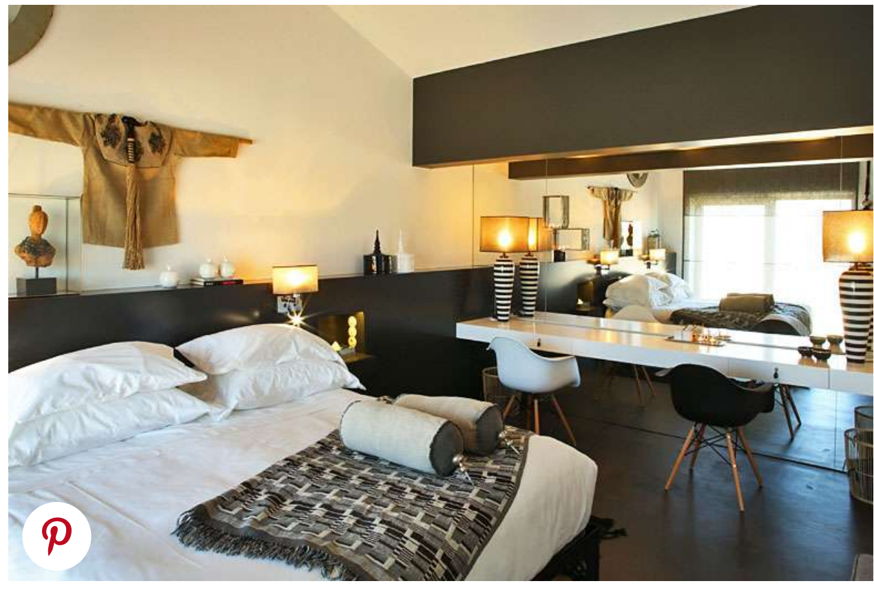
Bedroom in the master suite - photo courtesy of Torre de Palma Wine Hotel

While the looks vary from room to room, there are a few consistencies you can count on, such as air conditioning, a mini-bar, safe, hairdryer, wifi, robes, iPod docking station, TV, and more.