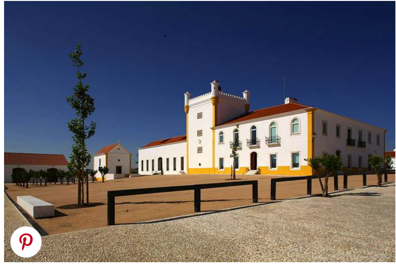
Torre de Palma Wine Hotel, Alentejo, Portugal