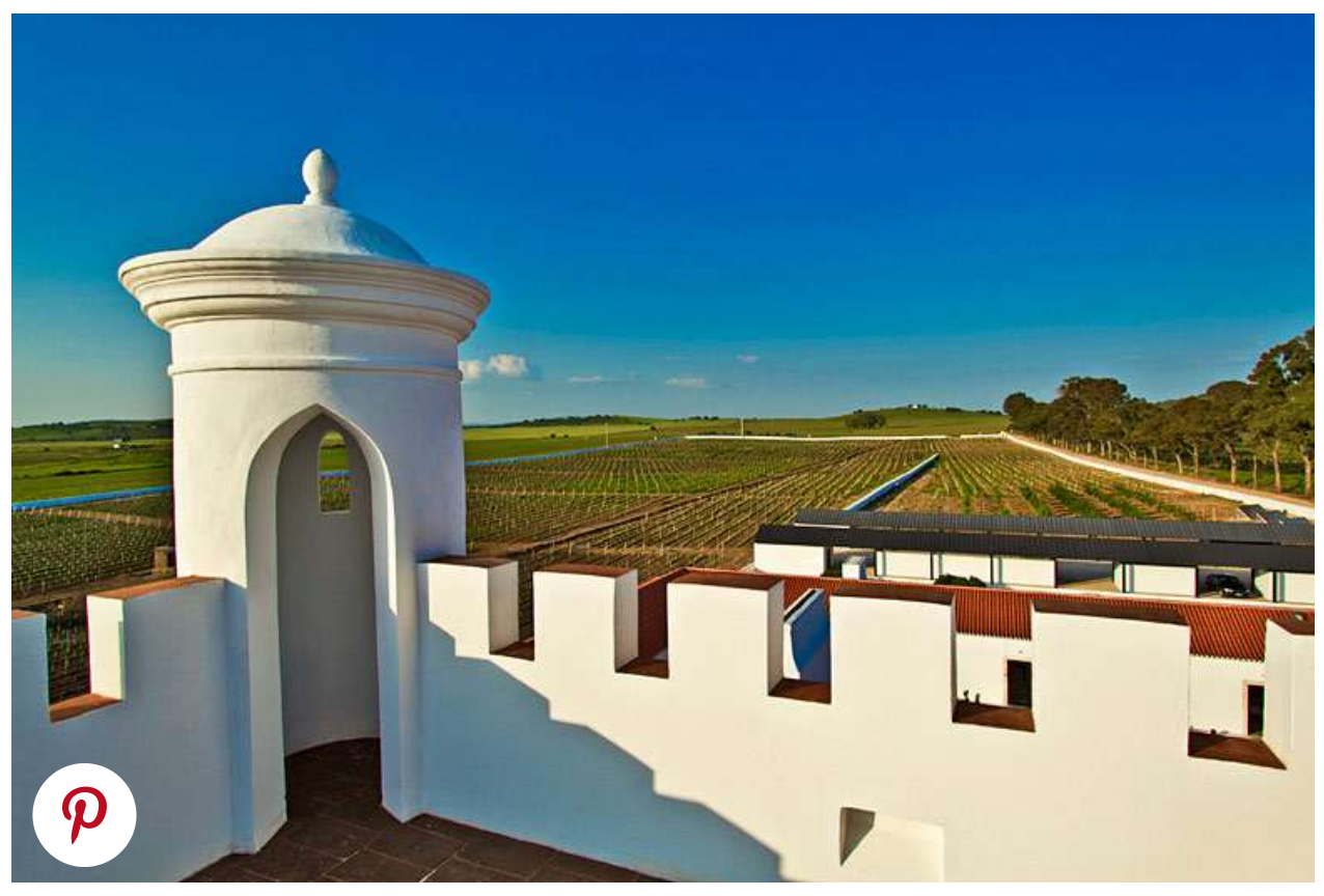
Enjoy the splendid views in every direction - photo courtesy of Torre de Palma Wine Hotel

Secondly, head for the hotel bar with rope swings suspended from the ceiling. Here you can sip on Torre de Palma wine or enjoy a chilled glass of bubbles in a cool sophisticated environment made for the big kids in all of us.