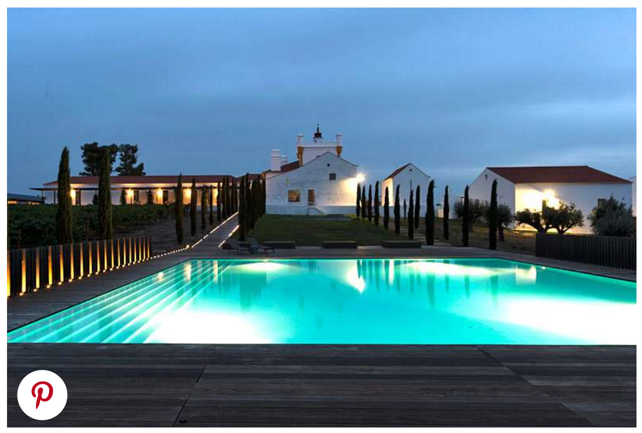
Take a dip among the vines

At Torre de Palma, it's all about making yourself comfortable, feeling at home, and indulging in life's little pleasures - forget your hectic lifestyle and slip into the laidback vibe. The public areas are very chilled with big soft sofas in the lounge where you can switch on a film or read a book, and intimate spaces in the bar. Lookout for curious works of art dotted around, such as the suspended (and scaled down) dinosaur skeleton.