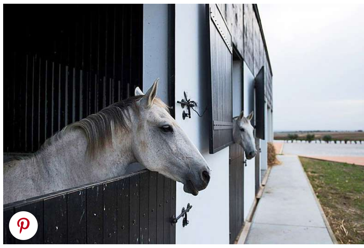
Meet the locals - photo courtesy of Torre de Palma Wine Hotel

Whether you're into horse riding or not, a short walk to the stables to meet the region's lusitano horses is a must. The Portuguese are rightfully proud of these strong, lean horses, whose connection with the Iberian peninsula dates back thousands of years. The staff will be on hand to tell you a little about the breed and may be able to supervise a quick brush or scratch behind the ears.