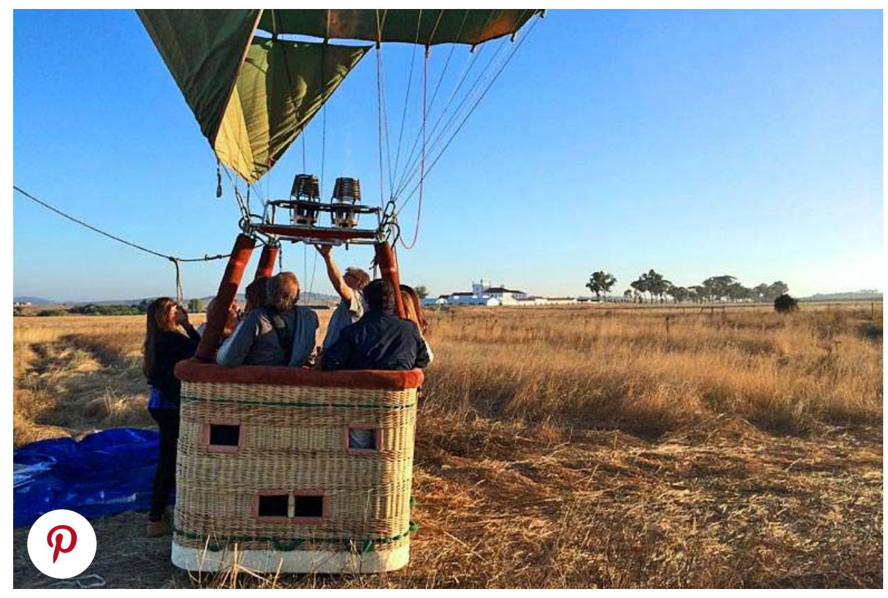
Experience a sunrise hot air balloon ride - photo courtesy of Torre de Palma Wine Hotel

If you fancy trying something a little more active, head to the stables and give horse riding a go. Whether you're a novice (opt for beginner's lessons in the paddock) or a pro on four legs, there's an appropriate horse riding experience for you. For a memorable start to the day, you might want to book an early morning hot air balloon ride to get your very own bird's eye view of the estate.