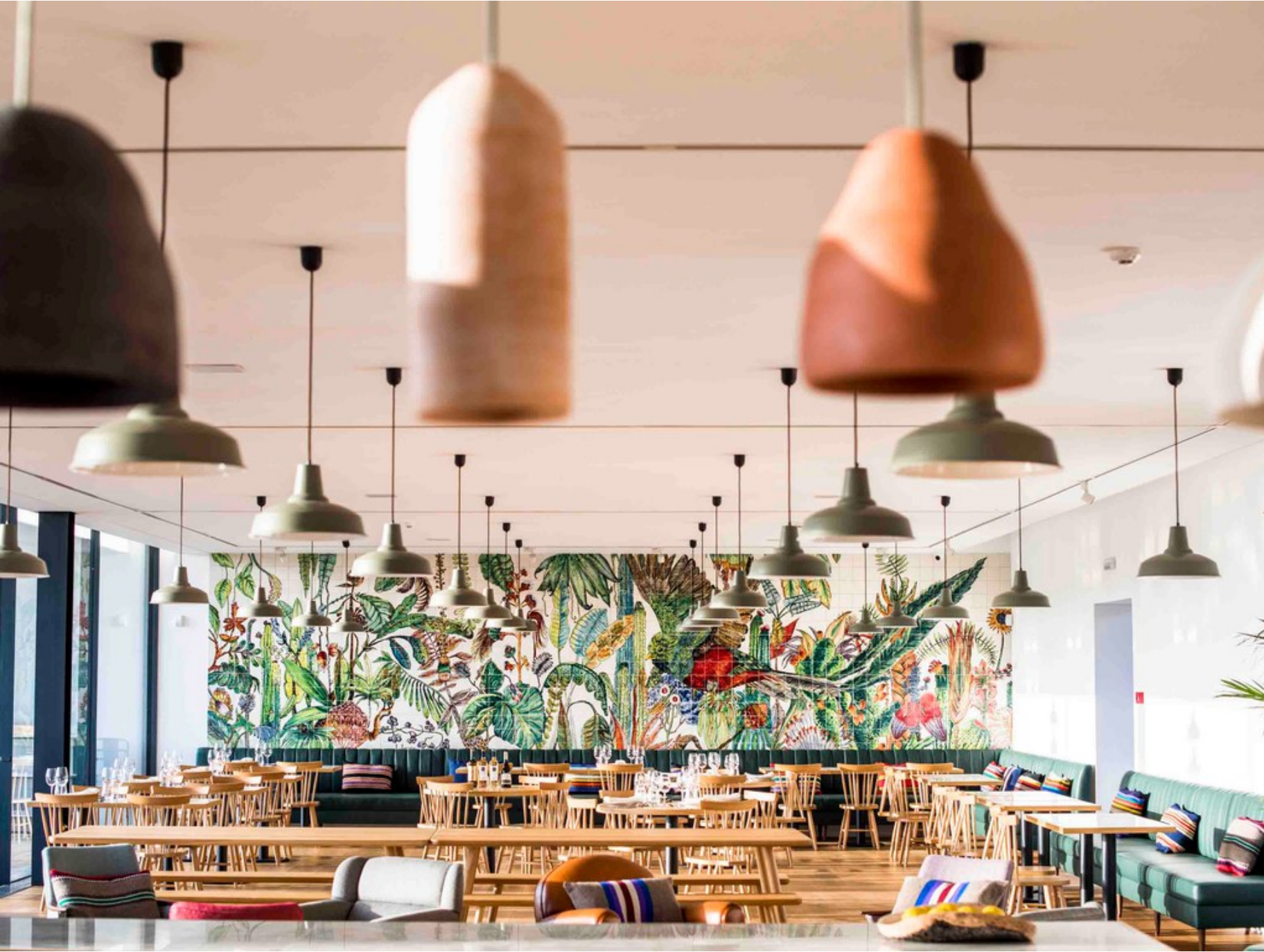
Owned by Dutch art collectors, Quinta do Quetzal is both a winery and art gallery.

Alentajana cows, and black pigs, and makes lovely olive oils and wines, including the refreshing Monte de Peceguina rosé. Relax at the B&B's swimming pool or spa, and come evening, head to its restaurant for seafood from the nearby Algarve, or pork and beef entrées with a decidedly modern flare.