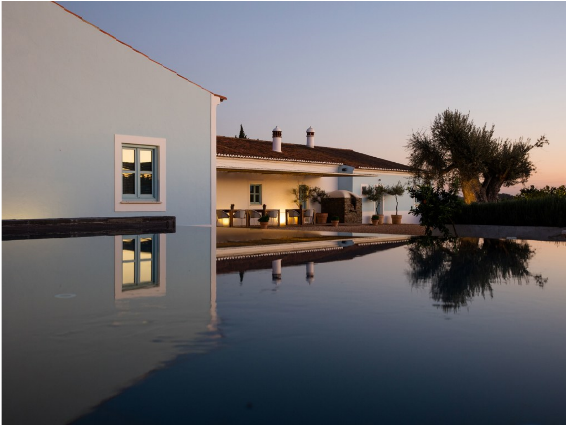
Herdade da Malhadinha Nova is a chic B&B in the middle of a 1,100-acre estate.

Dreamy scenery and world-class vineyards make Alentejo a wine-lover’s paradise—and it’s all just a short drive from the Portuguese capital.