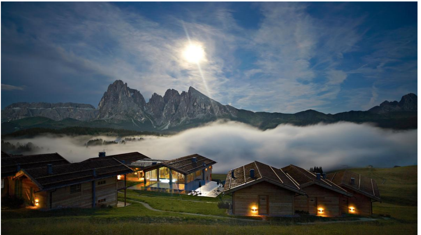
Adler Mountain Lodge, Italy